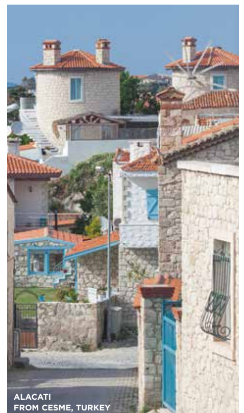
ALACATI FROM CESME, TURKEY