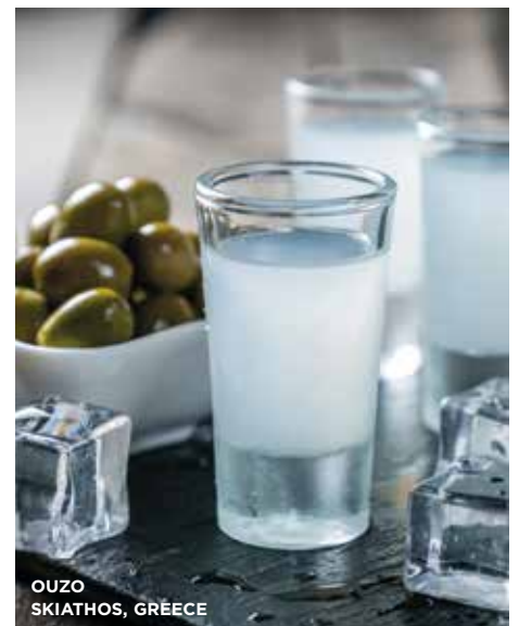
OUZO SKIATHOS, GREECE